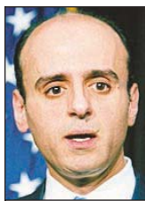
Ambassador Adel Al-Jubeir